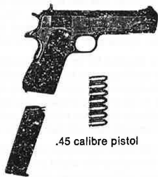
.45 calibre pistol